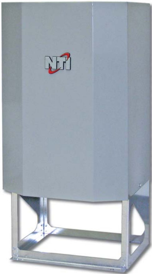
Ti-150 with optional floor stand